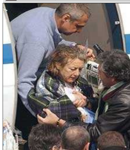
Injured Giuliana Sgrena is helped from the plane in Rome.