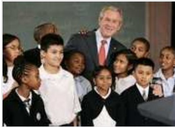
U.S. President George W. Bush poses with children from Public School 76 after giving a...