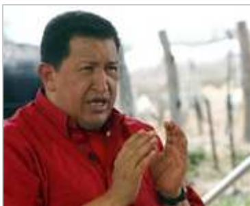
Venezuelan President Hugo Chavez speaks during his weekly broadcast 'Alo Presidente' in the town of...